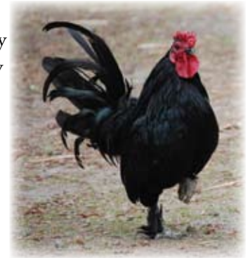
Dear, Sweet Benjamin