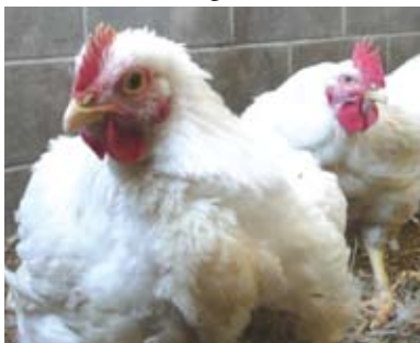
Quake and Vandross, rescued from Canandaigua Academy, now live at Farm Sanctuary.