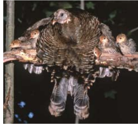
A Mother Turkey and Her Young - "Their Kind and Careful Parent"