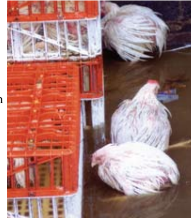
Chickens abandoned in flooded lot by Kapparat practitioners in Brooklyn, NY