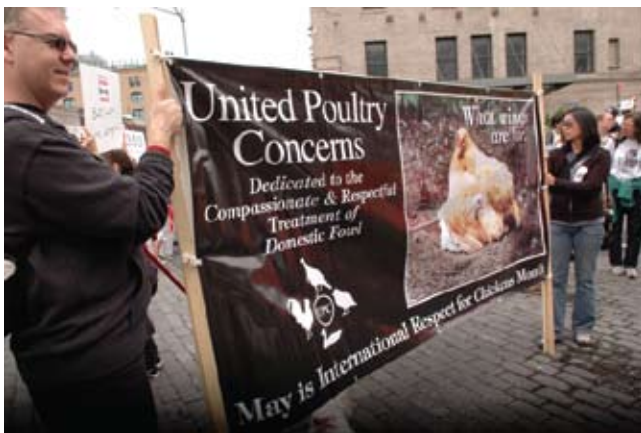
UPC activists Franklin Wade & Liqin Cao marched for chickens in 2008