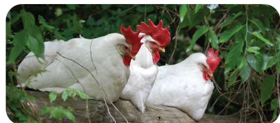
Photo of UPC sanctuary hens

This ad is sponsored by United Poultry Concerns, a nonprofit organization that promotes the compassionate and respectful treatment of domestic fowl. www.upc-online.org